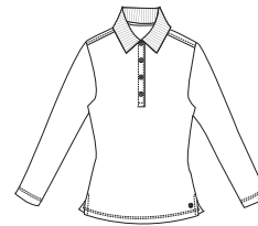
S/S POLO 5-2100-300 39509850